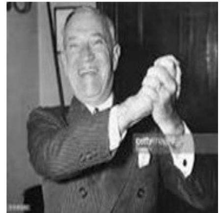
U.S. Senator Robert F. Wagner (1877-1953)

The NLRB also sets up and monitors employees' elections for the purpose of choosing union representation. If a majority of workers vote for a union, the NLRB will officially declare that the union may enter into collective bargaining on behalf of employees. With